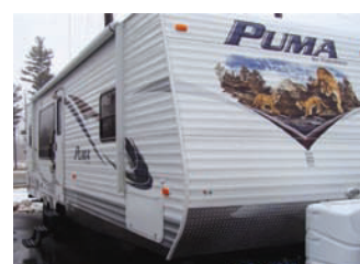
NEW 2011 Puma 30RK Travel Trailer Air, Furnace, awning, power slide-out, leveling systems, more. Retail: $29,995. Sale Price: $16,995 Save $13,000!!!!