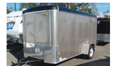
New 6x12 Cargo Trailer Ramp door in back, side door entrance. By Royal Cargo Retail - $3,599. Sale Price - $2,395

231-347-3200 toll free - 866-869-2755 2215 US 31 NORTH PETOSKEY