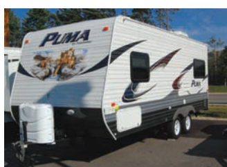
New 2013 Palomino Puma 19-RL Travel Trailer Air, awning, microwave, TV antenna and more. Retail: $17,623 Sale Price: $12,995 You Save $4,628