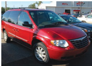
2005 Town & Country Seats 7, Stow-N-Go, power, leather, loaded. Just $499 Down

Warranties on All Vehicles • Over 100 in stock