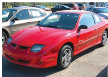
2002 Pontiac Sunfire Auto, power, cruise, air, sunroof. Great MPG. $199 down