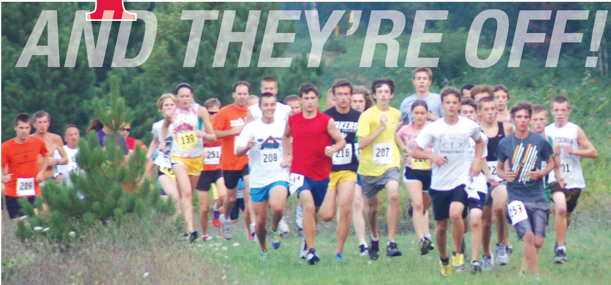
All 114 participants in the Boyne Falls 5K Cross Country run try and make their way to the front of the pack.

Charlevoix County News Section B Thursday August 9, 2012 CALL (231) 330-8062 FAX (888) 854-7441