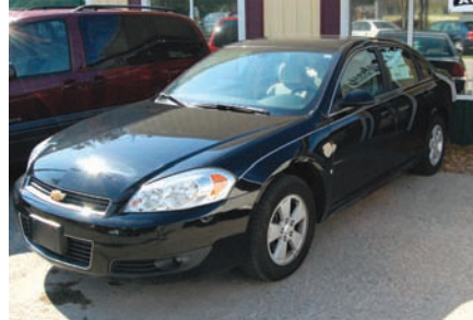
2010 Chevy Impala LT Air cruise, remote keyless entry, loaded. Black beauty. As low as $199 month