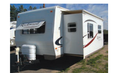
Used 2006 Rockwood 30' Travel Trailer Front kitchen, super slide. Retail: $15,995 Sale Price: $11,995 You Save $4,000!