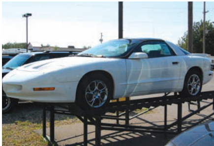
1995 Pontiac Firebird Power windows, a/c, V-6. Just 114K miles. What a classic beauty! Just $4,995