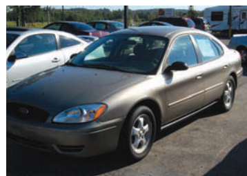
2006 Ford Taurus Cruise, CD, Power. $399 down