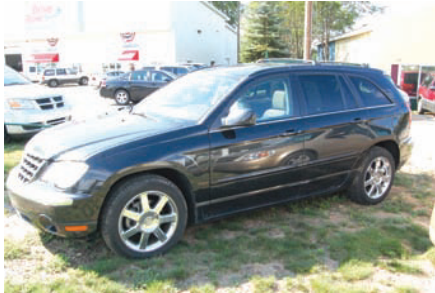
2007 Chrysler Pacifica GPS navigation, AWD, loaded. As low as $249 month