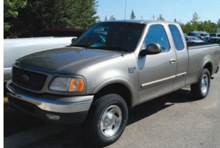
2001 Ford F-150 XLT Supercab 4x4, 8 cyl, auto, air, cruise, tow pkg, remote keyless entry, seats 6. As low as $199 month