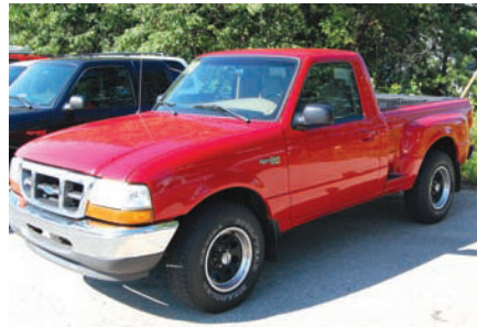
1998 Ford Ranger step-side Air, auto, 4 cyl, bedliner. As low as $149 month

Good Credit? Bad Credit? No Credit? No Problem!