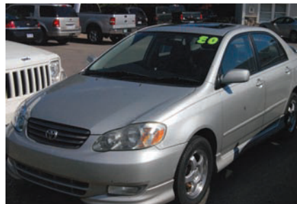
2003 Toyota Corolla 5 speed, 4 cyl, air, cruise. Great MPG. As low as $149 month