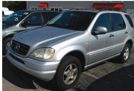
2000 Mercedes M-Class ML 320 AWD, leather, loaded (it's a Mercedes). As low as $199 month