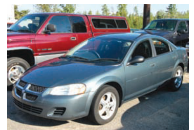
2005 Dodge Stratus SXT Gas saver. $199 down