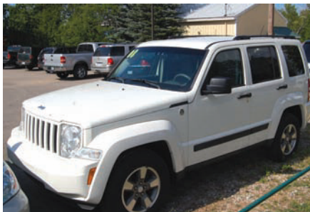
2008 Jeep Liberty Sport Air, cruise, remote keyless entry, 70K miles. As low as $249 month