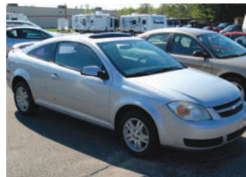
2006 Chevy Cobalt LT 2 door, leather, sunroof, loaded. $199 down