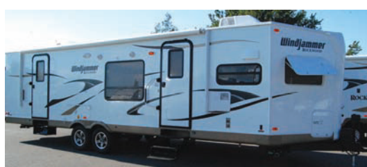
New 2013 Windjammer 34' Travel Trailer ½ ton towable. Retail: $34,182 Sale Price: $26,995 You Save $7,187