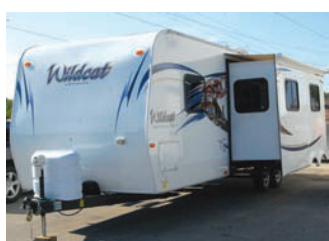
New 2011 Wildcat Bunkhouse 30BHS Travel Trailer Flat Screen TV, slide topper awnings, loaded. Retail: $22,995 Sale price: $18,995 You Save $4,000!