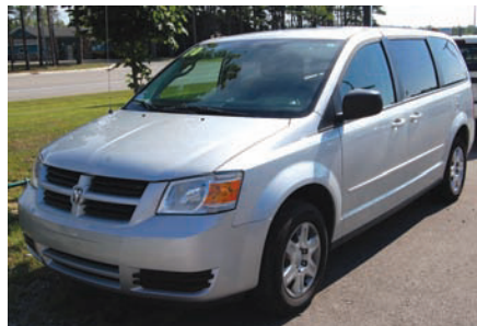
2010 Dodge Grand Caravan Seats 7, 4 captains chairs, air, cruise, remote keyless entry, 71K miles. As low as $225 month