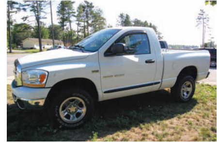
2006 Dodge Ram 1500 SLT Regular cab, 4x4, 8 cyl, 5.7L fuel injected Hemi. Power, air, cruise, auto. As low as $199 month