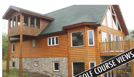
GOLF COURSE VIEWS

13456 STOVER ROAD, UNIT #15, CHARLEVOIX Looking for maintenance free living in northern Michigan? Well you have found it! This condo is move in ready and the tasteful furniture and furnishings can be negotiated with the sale! Need a place to park your boat? This condo offers that too! With the marina, launch and beach around the corner as well as a restaurant/bar this condo is the perfect getaway! MLS 432854. Ask for Jennifer Burr-Cutler. $88,000