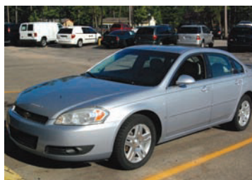
2006 Chevy Impala V-6 3.9L, air, cruise, power, keyless entry, 25 MPG. $995 down