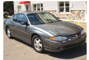
2004 Chevy Monte Carlo $499 down