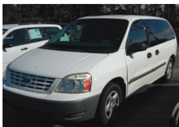
2006 Ford Freestar Cargo Van CD, Cruise, 199,000 miles. Just $2,995