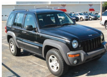
2004 Jeep Liberty Air, cruise, power, keyless entry, V-6 3.7L. $499 down