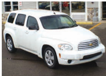
2009 Chevy HHR LS $999 down