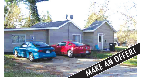
MAKE AN OFFER!