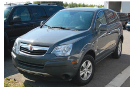
2008 Saturn Vue XE AWD, air, cruise, remote keyless entry. As low as $199 month